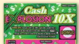
Cash Explosion ($2), #781

As of Feb. 29, 2024. Look at this general plan-o-gram set with the latest scratch-offs. Remember that inventory changes frequently, with new games scheduled for delivery March 26. Talk to your sales representatives for the latest updates and planogram suggestions.