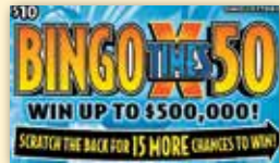
Bingo Times 50 ($10), #740