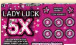
Lady Luck 5x ($1), #829