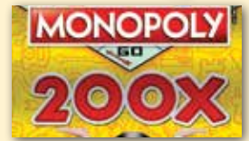
Monopoly 200x ($30), #696