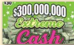
$300,000,000 Extreme Cash ($30), #785