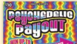
Psychedelic Payout ($10), #807