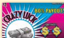
Crazy Luck ($2), #824