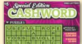
Special Edition Cashword ($5), #836