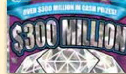
$300 Million Diamond Dazzler ($20), #671