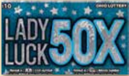
Lady Luck 50x ($10), #832