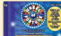
Wheel of Fortune ($5), #806