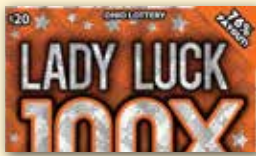
Lady Luck 100x ($20), #833