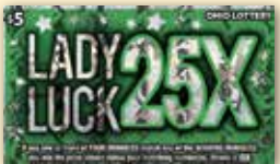
Lady Luck 25x ($5), #831