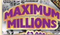
Maximum Millions ($20), #822