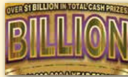
Billion ($50), #762