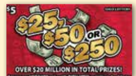
$25, $50 or $250 ($5), #627