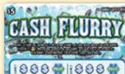
Cash Flurry ($5), #820