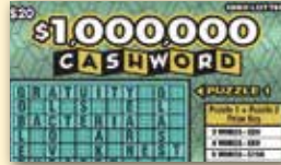
$1,000,000 Cashword ($20), #838