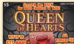
Queen of Hearts ($5), #825