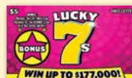
Lucky 7s ($5), #790