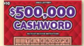
$500,000 Cashword ($10), #808