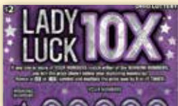
Lady Luck 10x ($2), #830