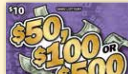
$50, $100, $500 ($10), #803