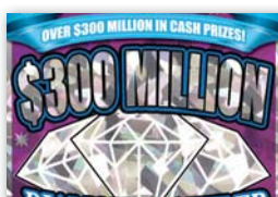
$300 Million Diamond Dazzler ($20), #1028