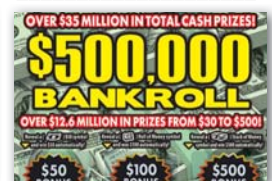
$500,000 Bankroll ($10), #1031