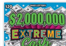
$2,000,000 Extreme Cash ($20), #1019