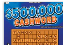
$500,000 Cashword ($10), #1026