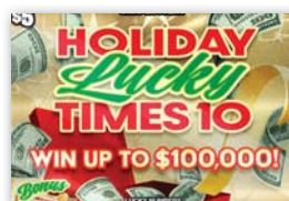
Holiday Lucky Times 10 ($5), #1046