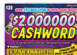
$2,000,000 Cashword ($30), #1051