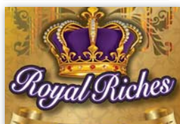
Royal Riches ($30), #1024