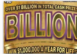
Billion ($50), #762