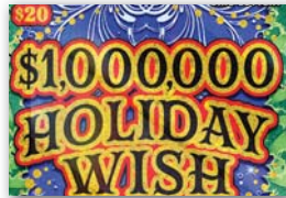
$1,000,000 Holiday Wish ($20), #1048