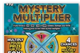
Mystery Multiplier ($10), #1042