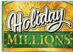
Holiday Millions ($30), #1049