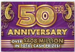
50th Anniversary ($50), #827