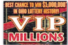
VIP Millions ($50) #1008