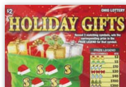
Holiday Gifts ($2), #1045