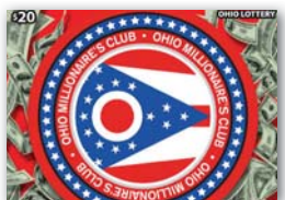
Ohio Millionaire's Club ($20), #1043