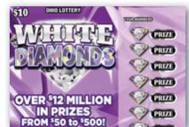
White Diamonds ($10), #1036