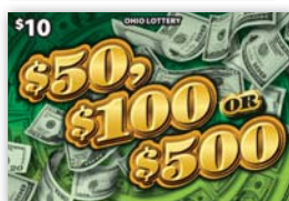
$50, $100, $500 ($10), #1050