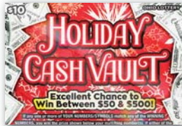
Holiday Cash Vault ($10), #1047

Top 25 scratch-offs, week ending Nov. 1, 2025.