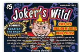
Joker's Wild ($5), #1030