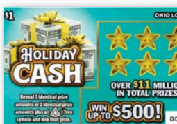
Holiday Cash ($1), #1044