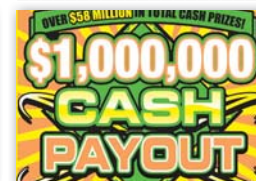
$1,000,000 Cash Payout ($20), #1032