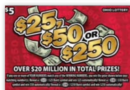
$25, $50 or $250 ($5), #1050