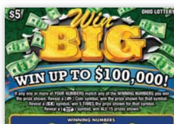
Win Big ($5), #1041