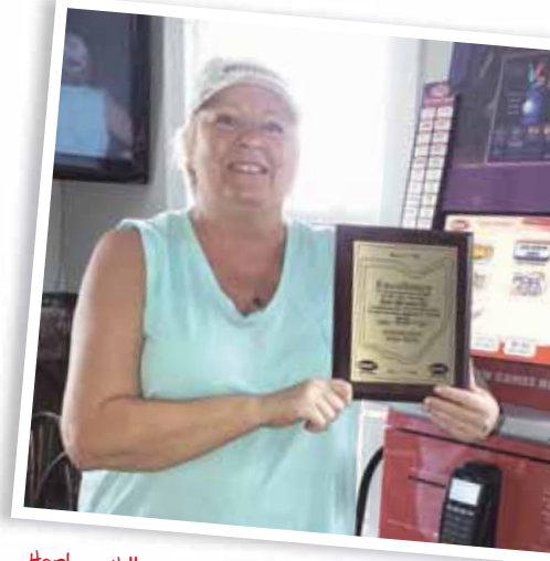
Harbor Hills Country Club, Hebron Keno Million Dollar Club, FY21